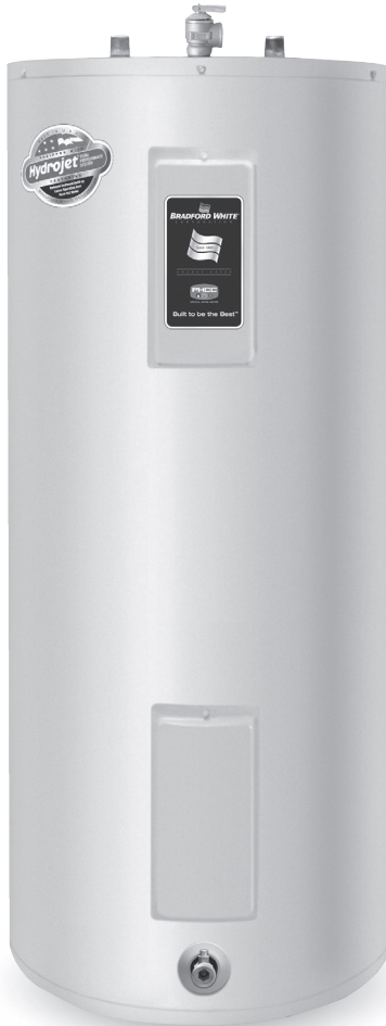
Photo is of RE350T6